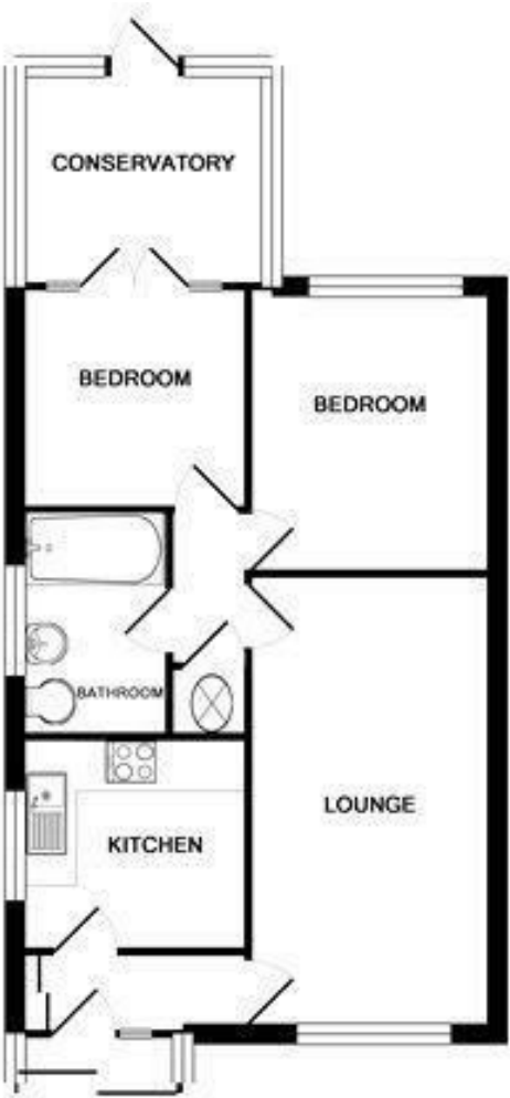
Made with Metropix ©2011

23a Llandeilo Road, Cross Hands, Llanelli, Dyfed, SA14 6NA